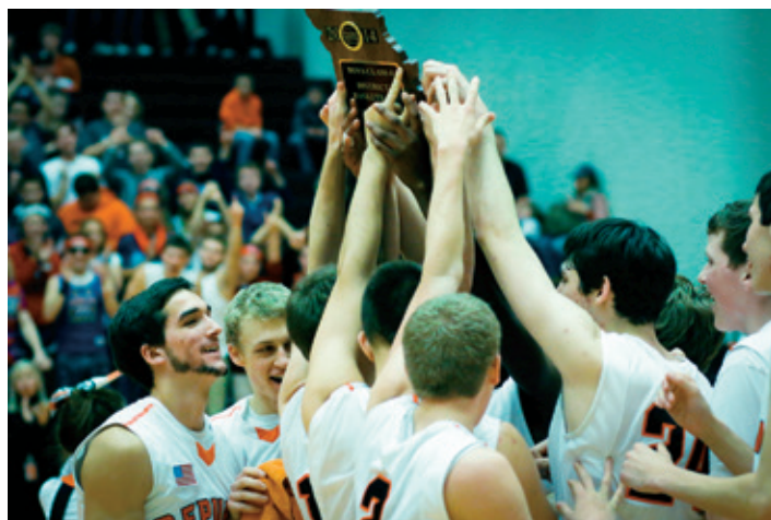
The Tigers swept through their district tournament with a 66-34 win over Aurora, followed by a 54-36 blowout of Rogersville. It was the third time this season the Tigers had beaten the Wildcats.